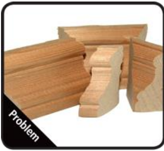
Brad nailing nightmare