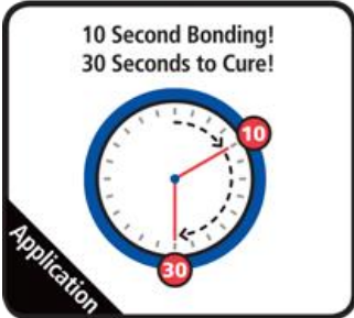
10 = 10 seconds to bond!