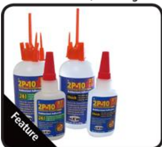
Rubber Toughened 2P-10