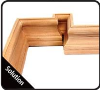
The 2P-10 solution!