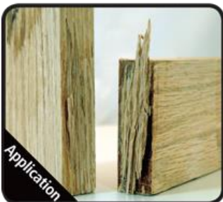
Breaks the wood, not the glue