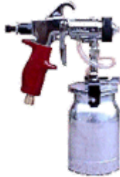
223XX One qt. cup gun - This is the standard gun unless a CUP OVER gun is selected.