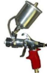
226XX 13.5 oz. CUP OVER GUN - With your choice of Fluid Set. If not indicated the standard 1.4 mm Fluid Set will be used