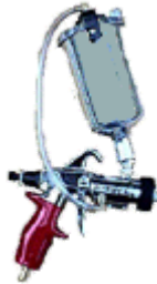
225XX 20 oz. CUP OVER GUN - With your choice of Fluid Set. If not indicated the standard 1.4 mm Fluid Set will be used