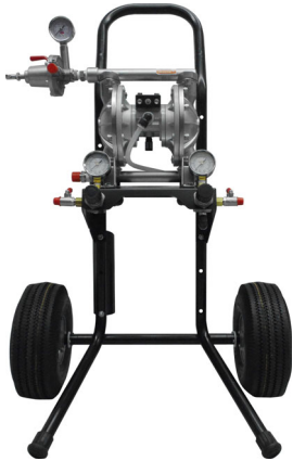
70-1102-5 DOUBLE DIAPHRAGM PUMP CART MOUNT (5 GALLON SIPHON)