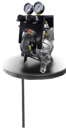
70-1103 DOUBLE DIAPHRAGM PUMP PAIL MOUNT (5 GALLON)