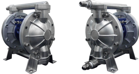
70-254 DOUBLE DIAPHRAGM PUMP (BARE PUMP)