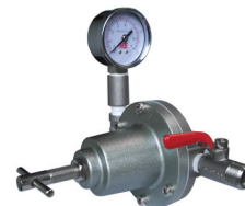
Fluid Regulator 52-203