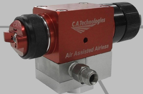
66-266 Standard Manifold