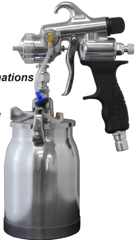
HVLP Turbine Gun and Cup Combo 60-TRBN-2