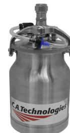
1 Quart Stainless Steel Pressure Cup 51-303SS