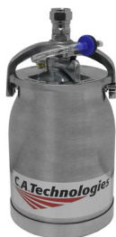
1 Quart Aluminum Pressure Cup 51-303