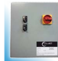
UL & ETL listed control panel