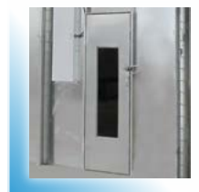
Windowed personnel access doors