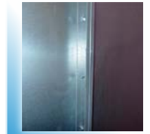
5/16" bolts with serrated lock nut