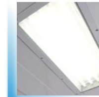
Industry-leading light levels