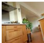
KITCHEN AND BATHROOM