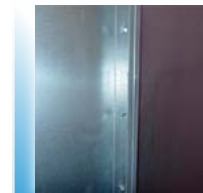
5/16" bolts with serrated lock nut