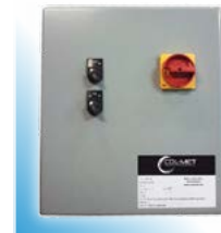
UL & ETL listed control panel