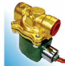
Air solenoid valve