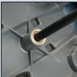
Central Shaft Seal

X5 mixing lids include the same great benefits as the previous lid generation including the improved sealing system, soft-touch finger tip controls, and the innovative 'S' shaped paddle to reduce over-stirring.