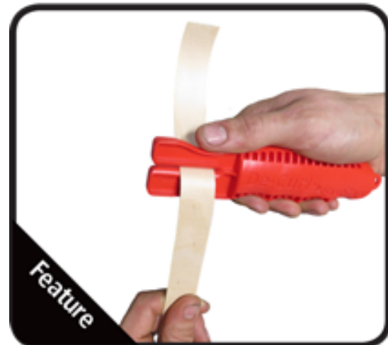
Easy to straighten