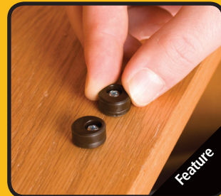
Easy to adjust