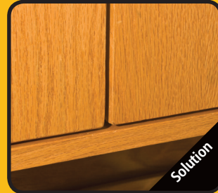
Doors shut and level