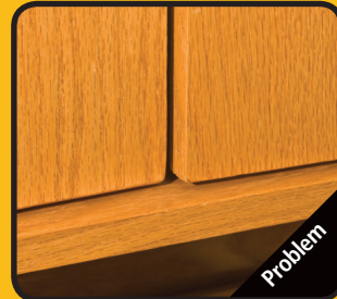
Uneven inset cabinet doors