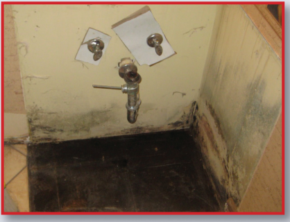
Locates moisture under bathroom vanities where mold thrives