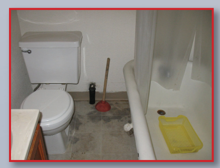
Locate moisture under bathroom floors