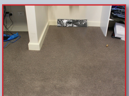
2 in. below carpet surface