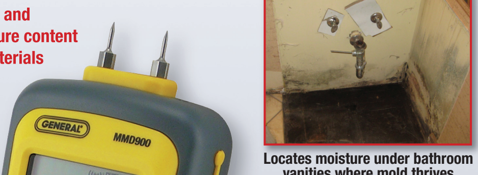
vanities where mold thrives

Remote Probe, 1 "9V" Battery, 2 Sets of Spare Pins, Hard Carrying Case, User's Manual and Warranty