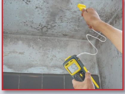
Pinned extension cable simplifies conventional measuring