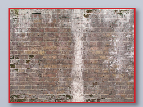
Check for moisture behind masonry