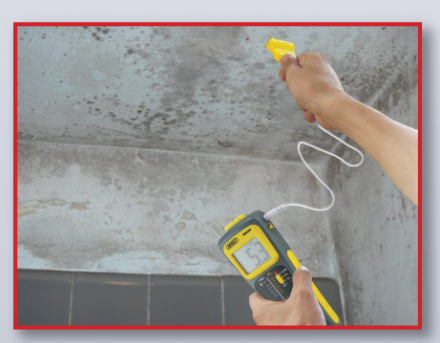
Pinned extension cable simplifies conventional measuring