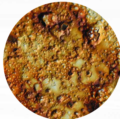
Spoiled Paint Finish